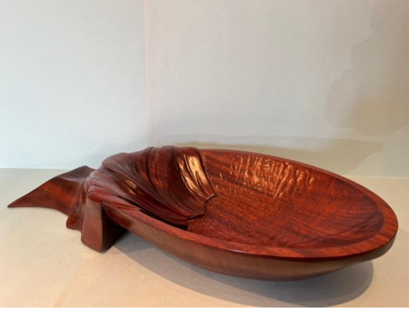
Chuck January – “Draped Linen” – mahogany wood