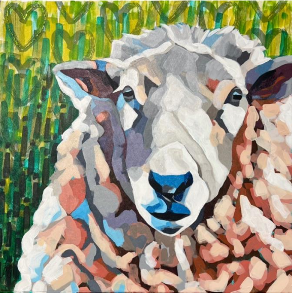
April Roderick – “I Love Ewe” – fluid acrylics over wallpaper